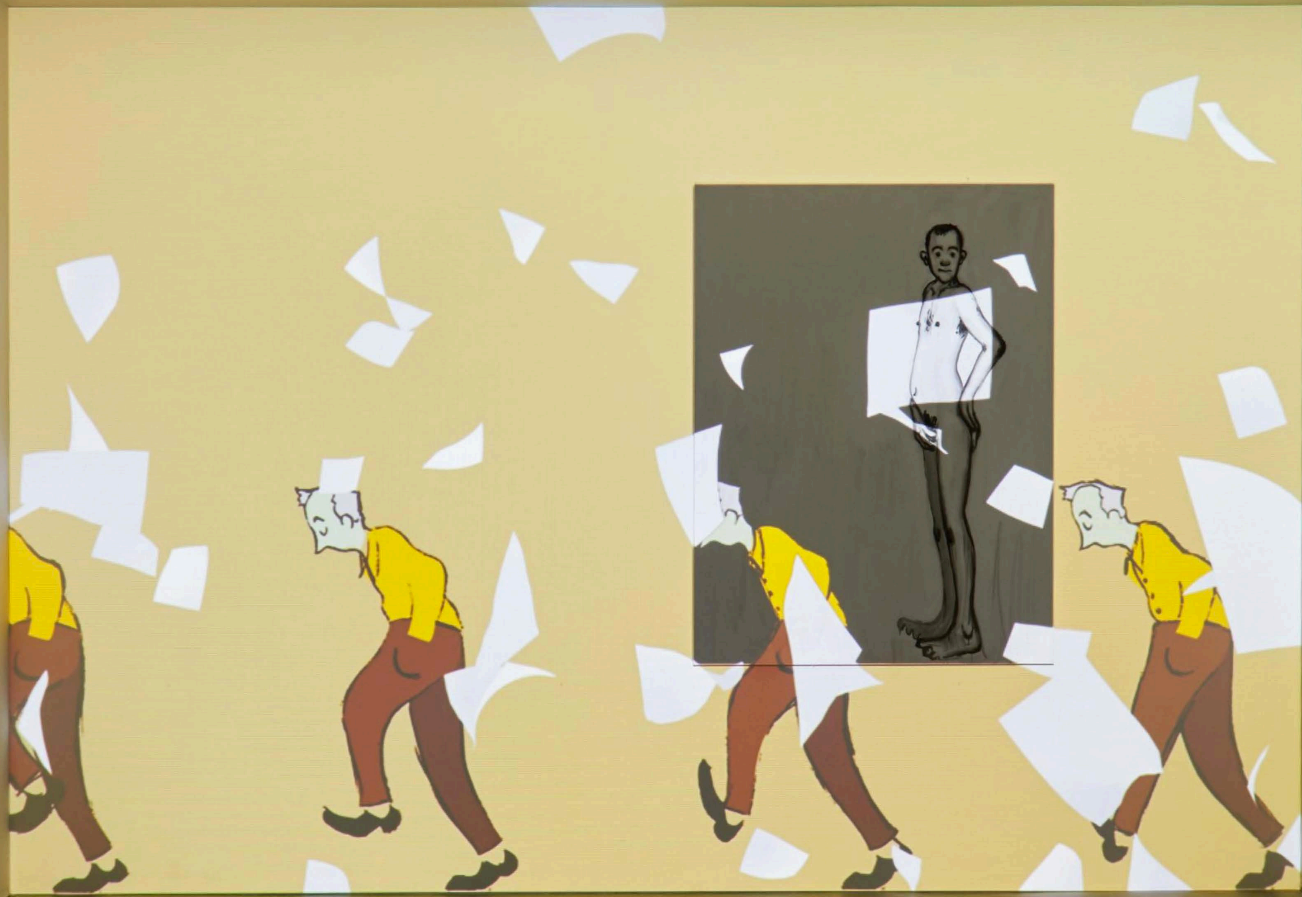
Sanya Kantarovsky, Happy Soul , 2015, installation view