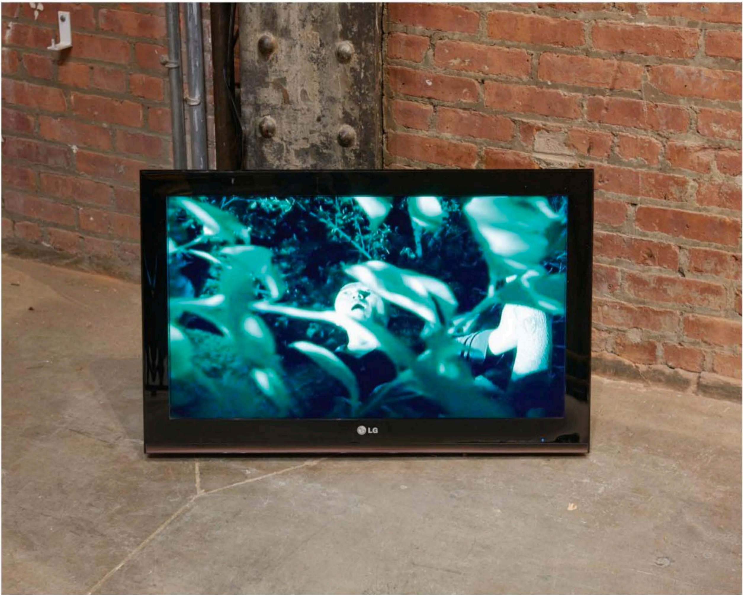
Zhou Tao, Chicken Speaks to Duck, Pig Speaks to Dog , 2005, installation view.