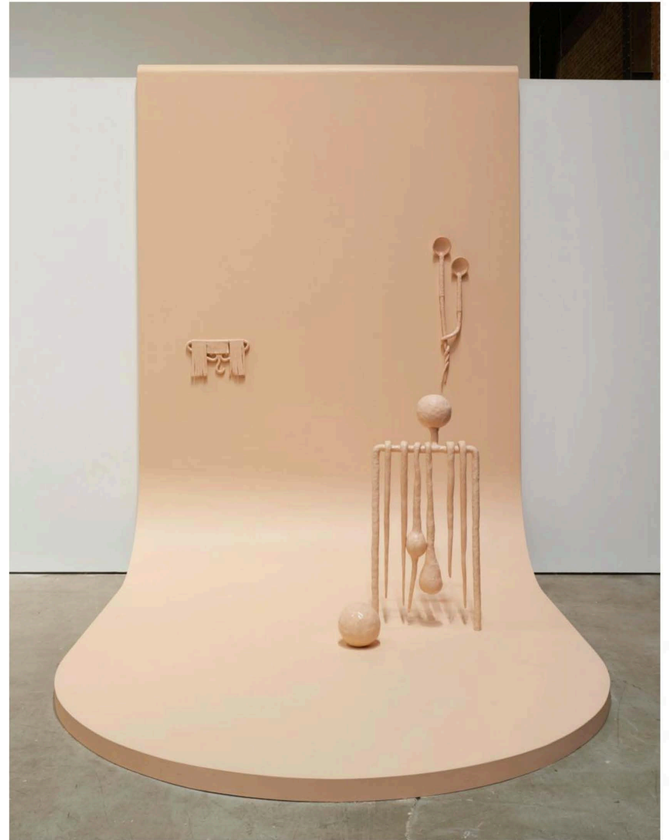
Ieva Misevičiūtė, Tongue PhD (Hardcover) , 2016, installation view.