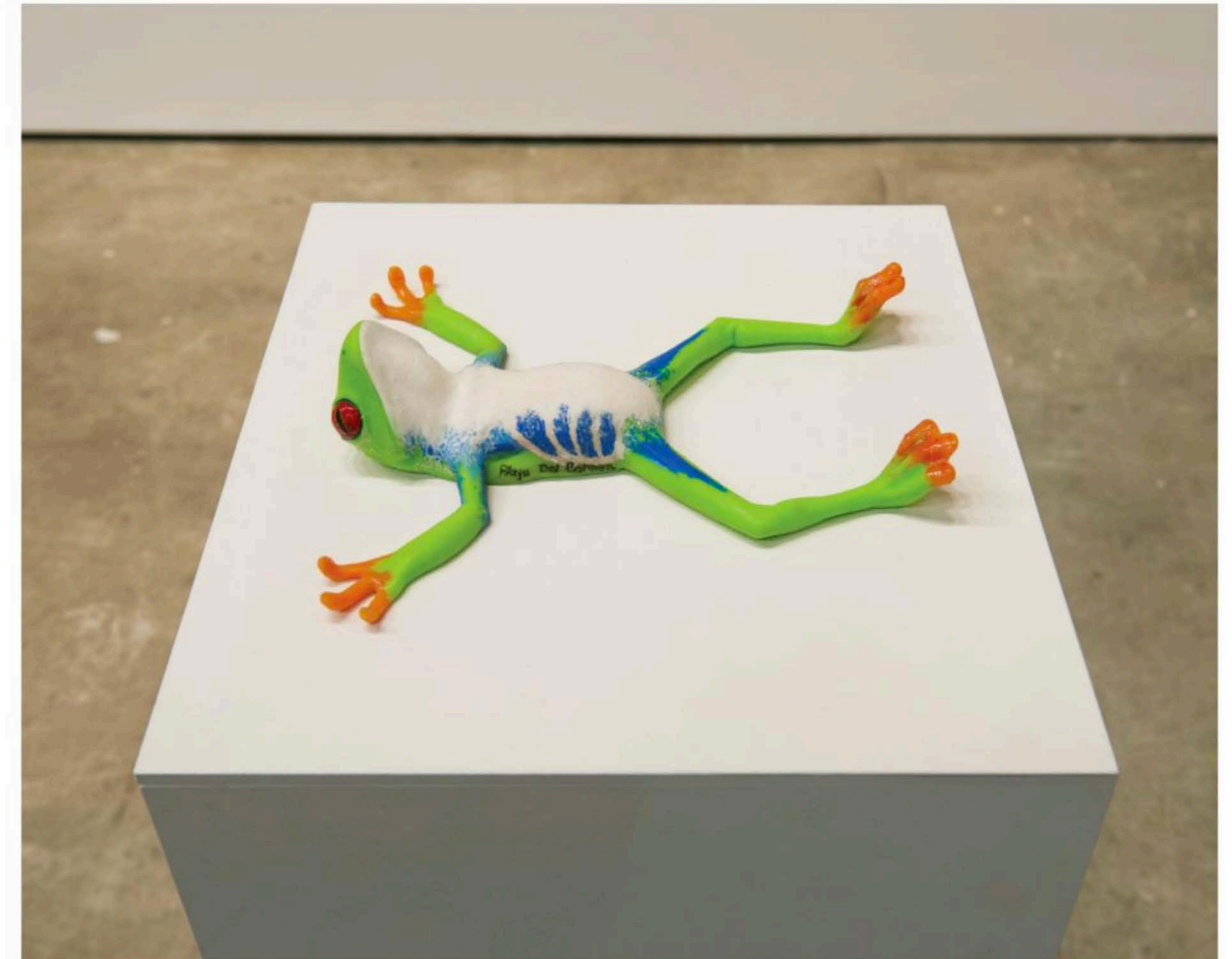
Adriana Lara, The Non-object (frog) , 2016, installation view.