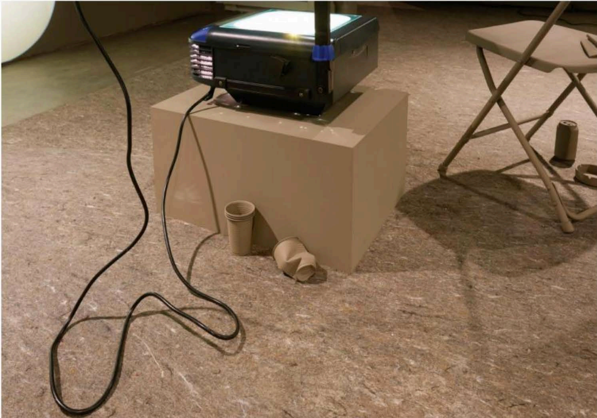
Georgia Sagri, Sunday Stroll , 2016, installation views.