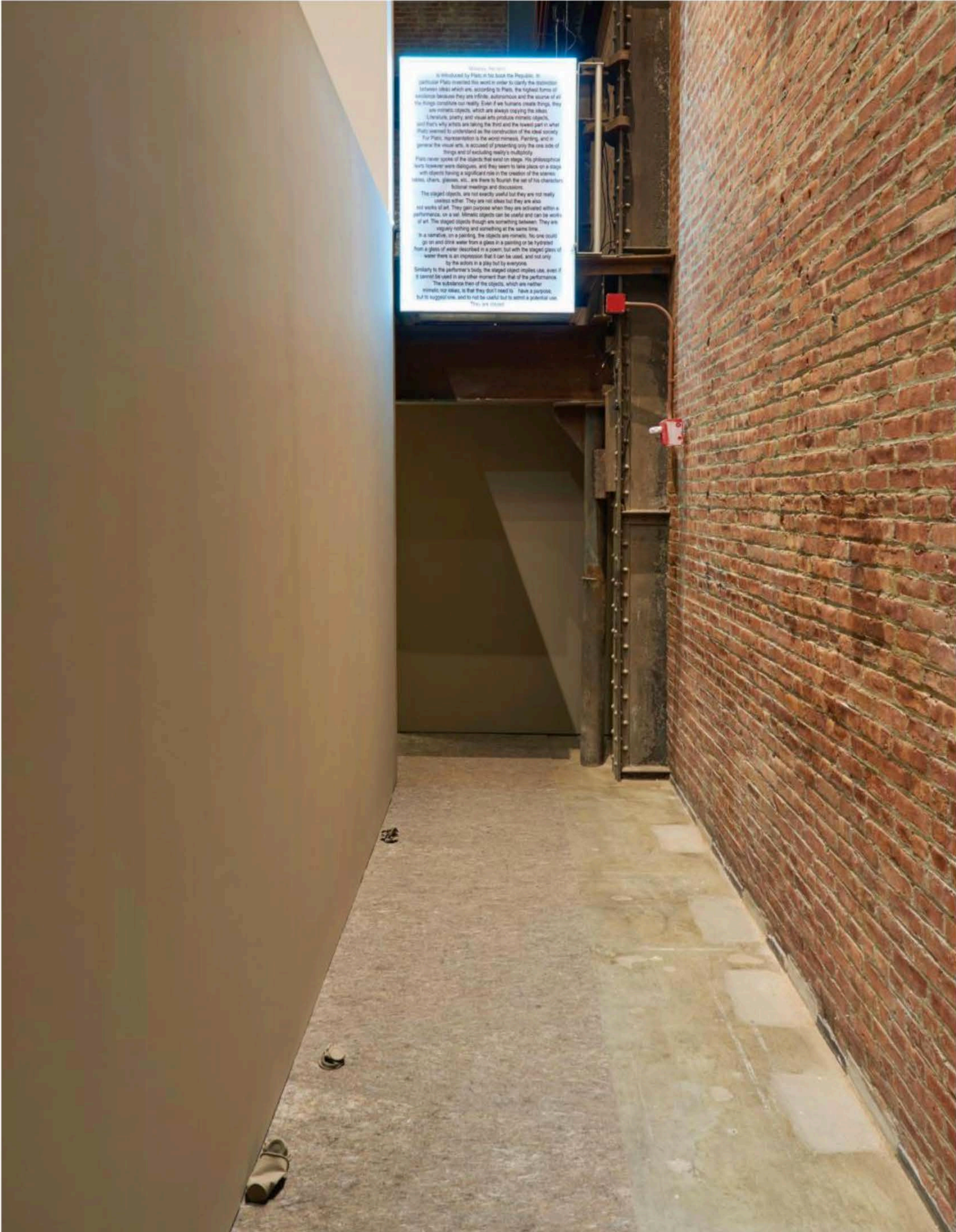
Georgia Sagri, STAGED , 2016, installation view.