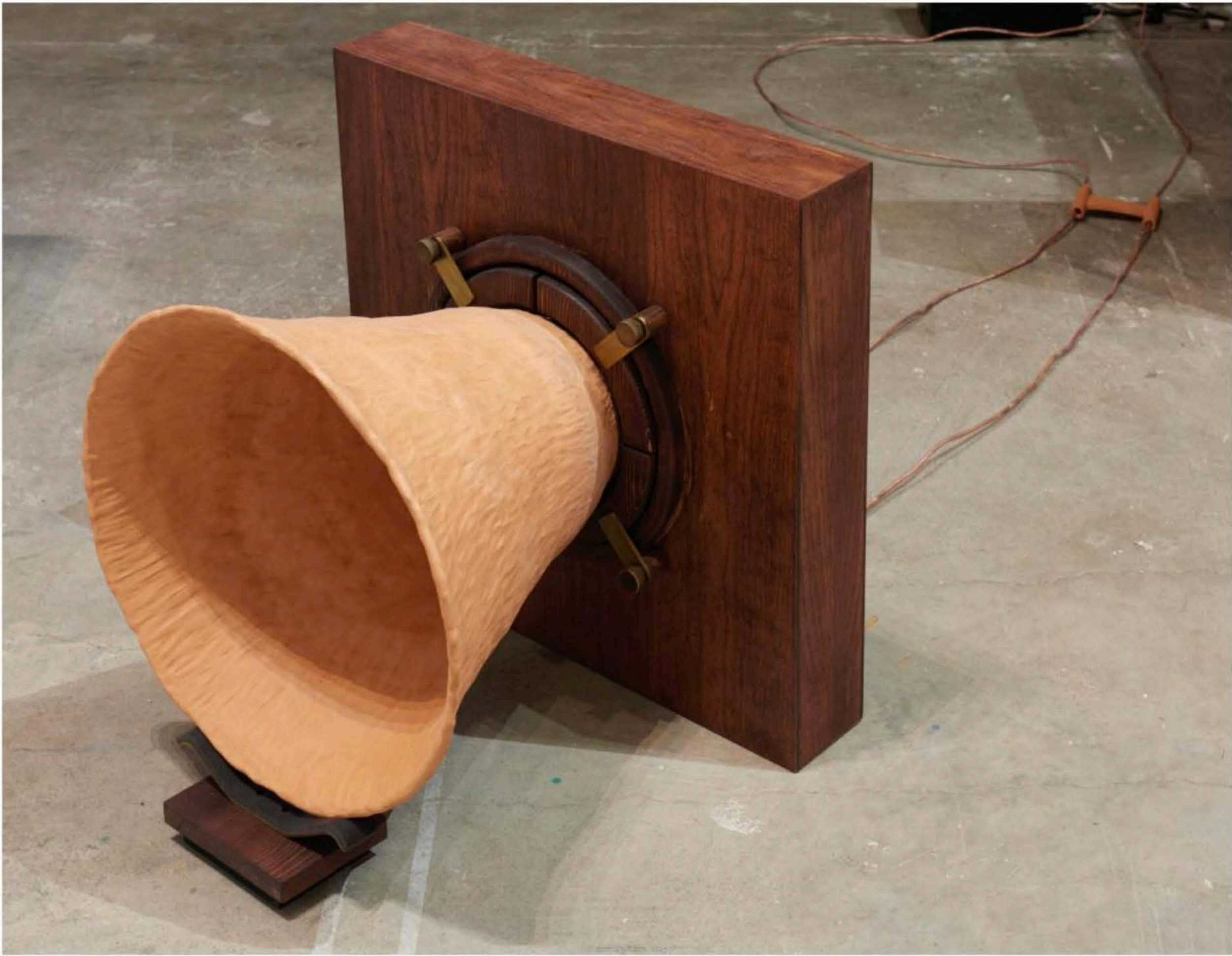
Jeanine Oleson, Matter-phone , 2016, installation view.