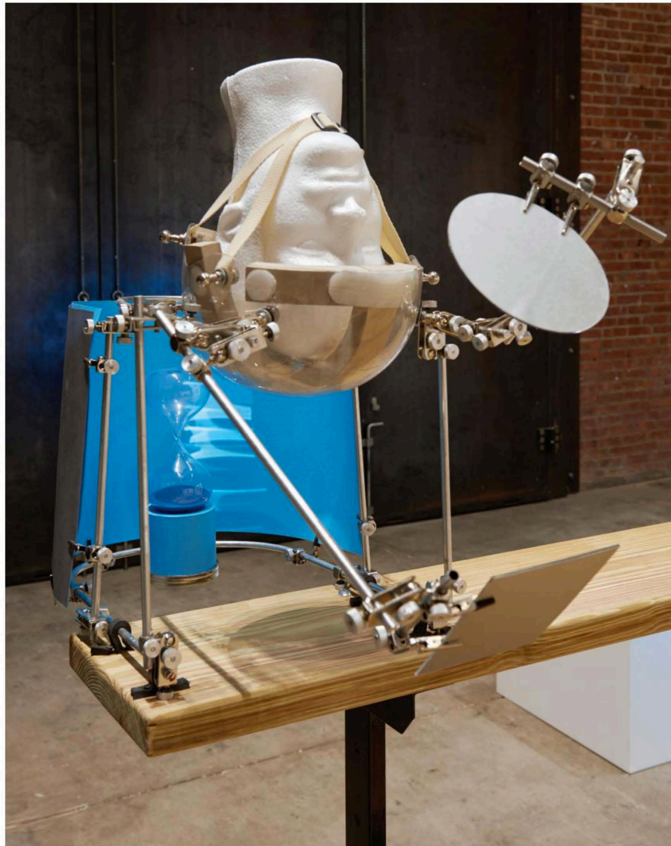
Eduardo Navarro, Five minutes ago , 2015, installation view.